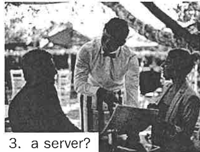
3. a server?