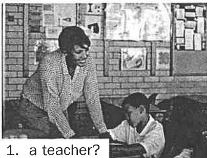
1. a teacher?