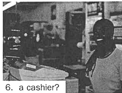
6. a cashier?