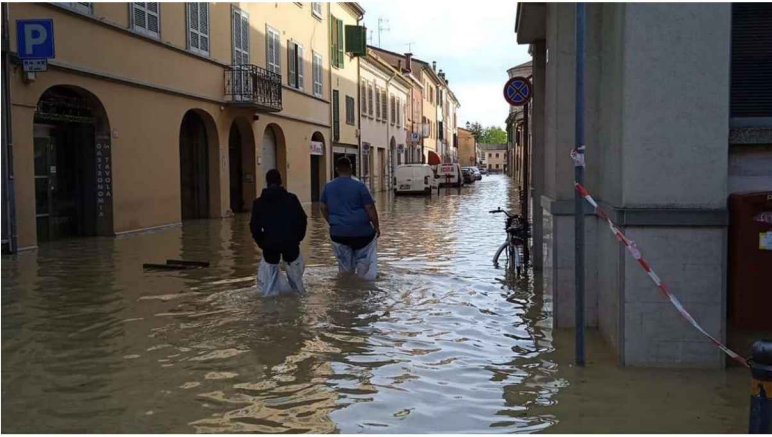
Flood This Photo by Unknown Author is licensed under CC BY-SA