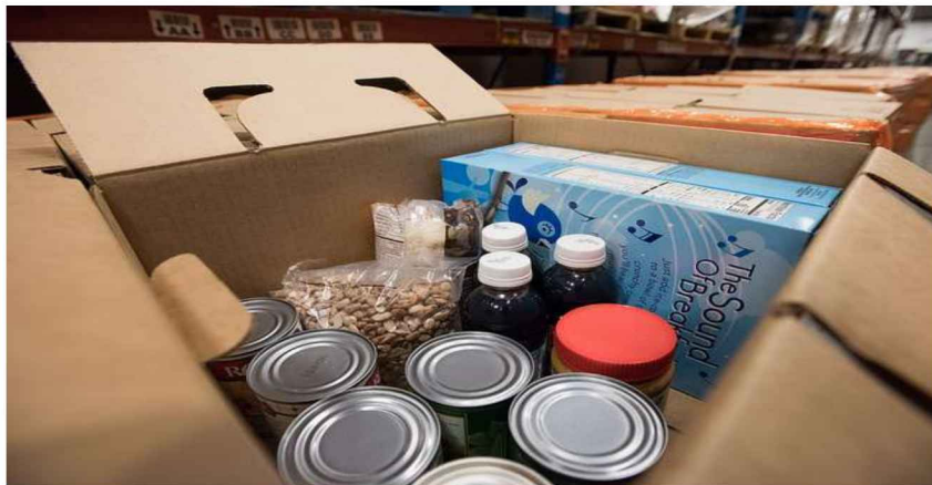
6. Emergency supplies kit