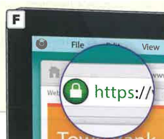
F. Use encrypted / secure sites.