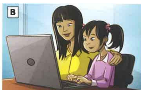
B. Monitor children's Internet use.