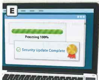
E. Update security software.