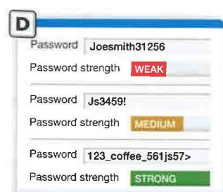
D. Create secure passwords.