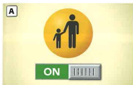
A. Turn on parental controls.