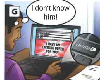
G. Delete suspicious emails.