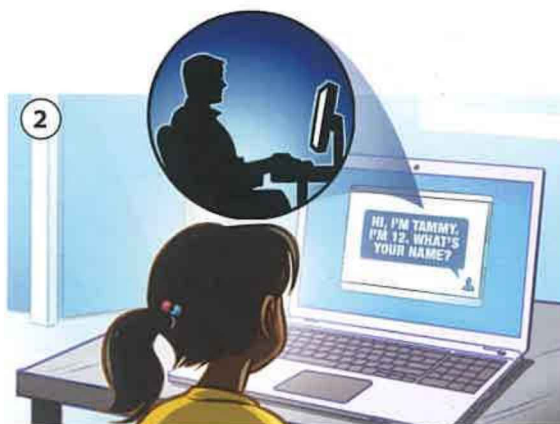
2. online predators