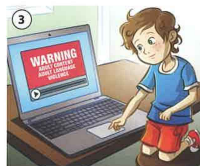
3. inappropriate material