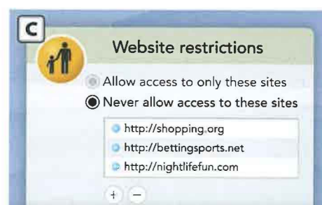
C. Block inappropriate sites.